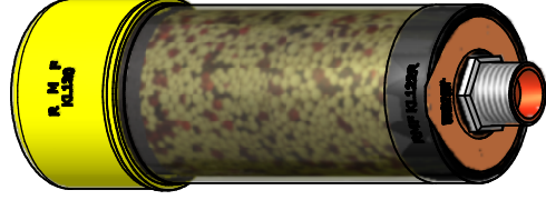
REMOVE SEAL AND PLUG BEFORE USE